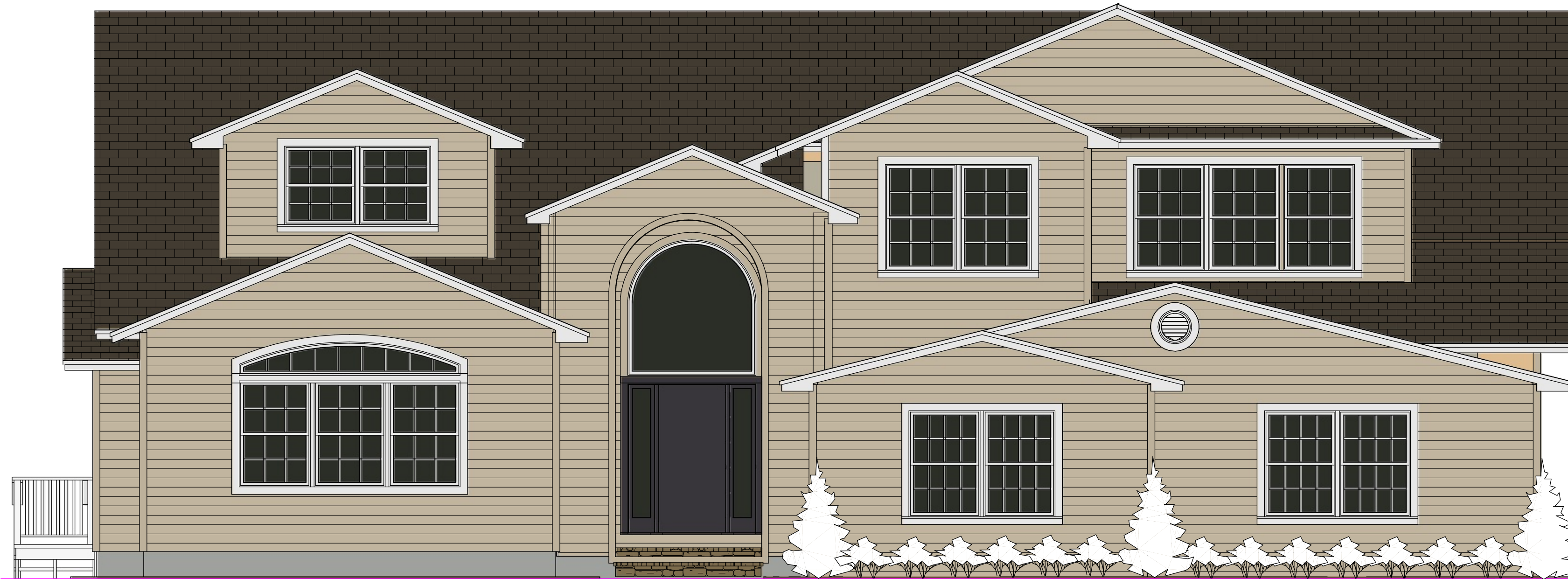
FRONT DESIGN ELEVATION SCALE: 1/4" = 1'-0"

Copyright of Architectural Drawings- These plans are protected by federal law and are subject to copyright protection as an "architectural work" under section 102 of the copyright act, 17 U.S.A. as amended December 1990 and known as Architectural Works Copyright Protection Act of 1990. These drawings are provided as an instrument for construction for the construction project at the address shown on the title block of the drawings and they may not be used for any project other than that listed at the address shown on the title block without the written consent and compensation of the architect. This protection includes but is not limited to the overall form as well as the arrangement and composition of spaces and elements of the designs. Under such protection, unauthorized use of these plans, work or home represented, can legally result in the cessation of construction or buildings being seized and/or monetary compensation to Edward Koenig.