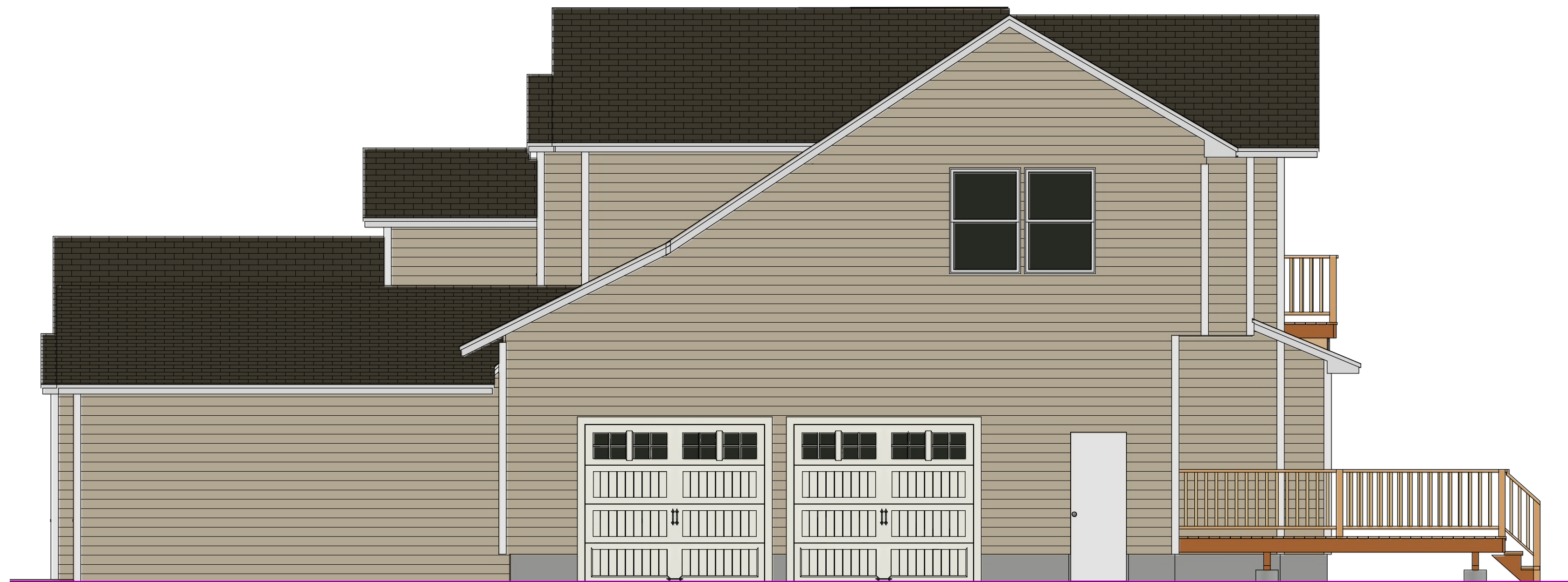
RIGHT DESIGN ELEVATION SCALE: 1/4" = 1'-0"