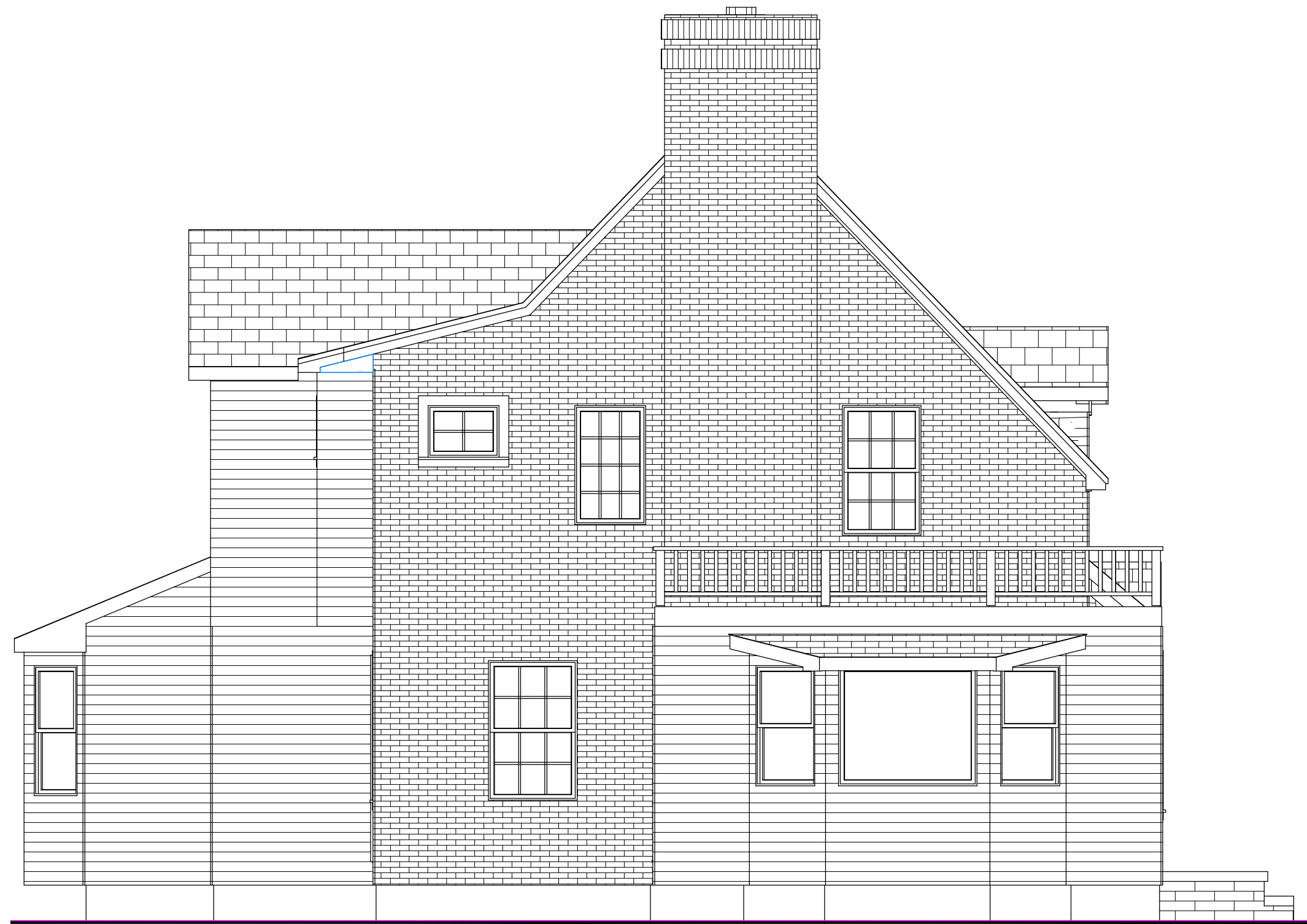
SHERLOCK DESIGN 5 - LEFT DESIGN ELEVATION SCALE: 1/4" = 1'-0"

Copyright of Architectural Drawings- These plans are protected by federal law and are subject to copyright protection as an "architectural work" under section 102 of the copyright act, 17 U.S.A. as amended December 1990 and known as Architectural Works Copyright Protection Act of 1990. These drawings are provided as an instrument for construction for the construction project at the address shown on the title block of the drawings and they may not be used for any project other than that listed at the address shown on the title block without the written consent and compensation of the architect. This protection includes but is not limited to the overall form as well as the arrangement and composition of spaces and elements of the designs. Under such protection, unauthorized use of these plans, work or home represented, can legally result in the cessation of construction or buildings being seized and/or monetary compensation to Carmelhill Architects and/or Edward Koenig.