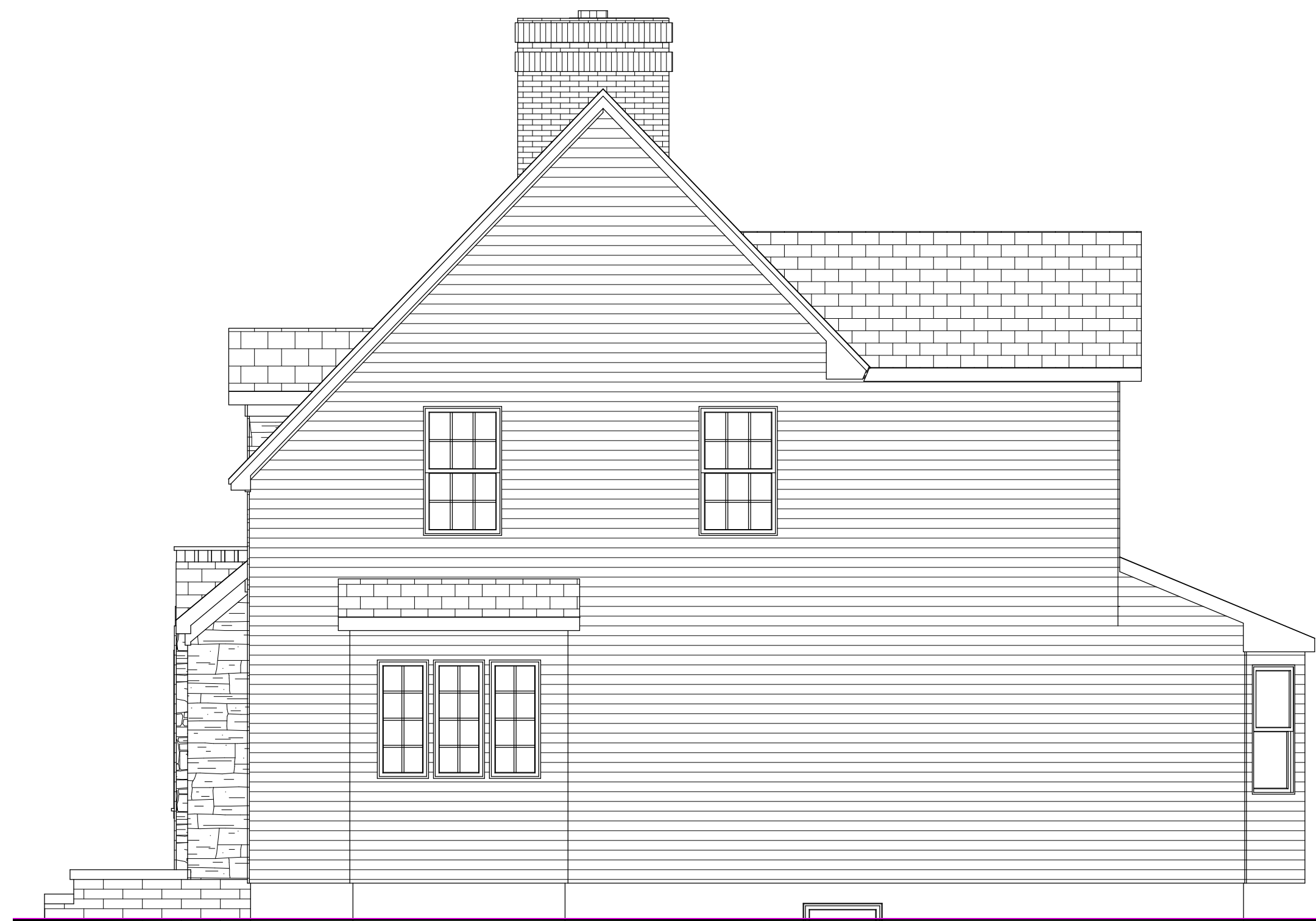
SHERLOCK DESIGN 5 - RIGHT DESIGN ELEVATION SCALE: 1/4" = 1'-0"