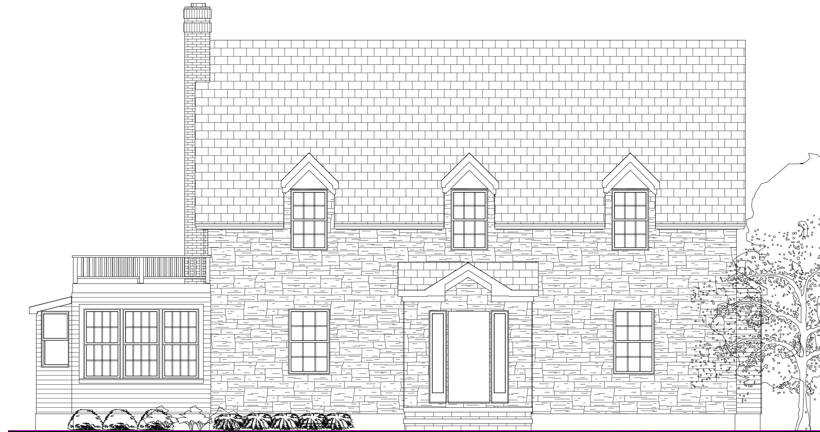
SHERLOCK DESIGN 5 - FRONT DESIGN ELEVATION SCALE: 1/4" = 1'-0"