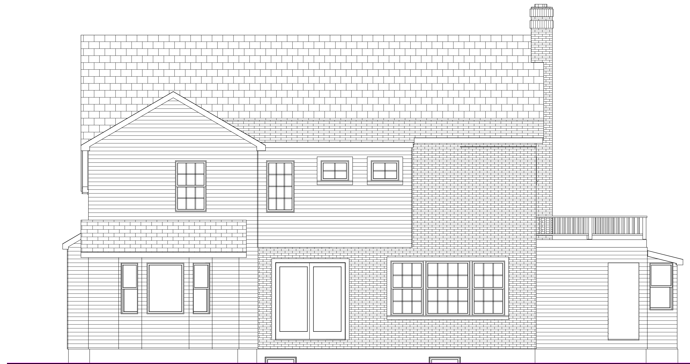
SHERLOCK DESIGN 5 - REAR DESIGN ELEVATION SCALE: 1/4" = 1'-0"