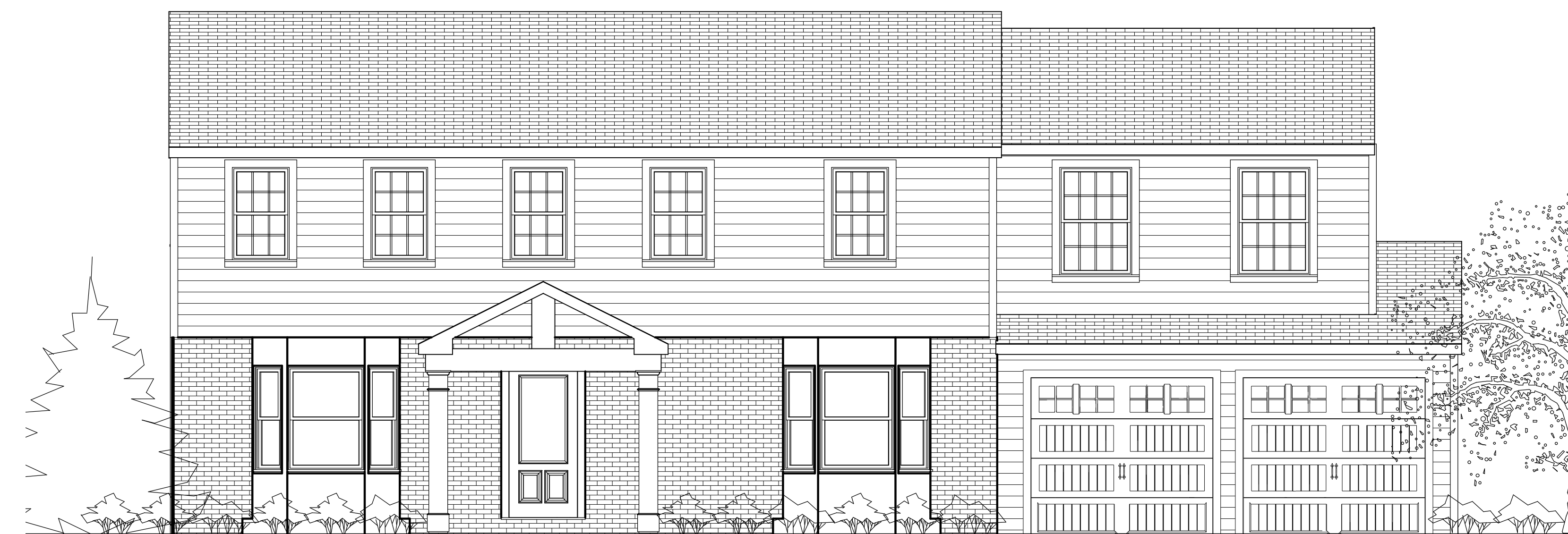
FRONT DESIGN ELEVATION SCALE: 1/4" = 1'-0"

Copyright of Architectural Drawings- These plans are protected by federal law and are subject to copyright protection as an "architectural work" under section 102 of the copyright act, 17 U.S.A. as amended December 1990 and known as Architectural Works Copyright Protection Act of 1990. These drawings are provided as an instrument for construction for the construction project at the address shown on the title block of the drawings and they may not be used for any project other than that listed at the address shown on the title block without the written consent and compensation of the architect. This protection includes but is not limited to the overall form as well as the arrangement and composition of spaces and elements of the designs. Under such protection, unauthorized use of these plans, work or home represented, can legally result in the cessation of construction or buildings being seized and/or monetary compensation to Carmelhill Architects and/or Edward Koenig.